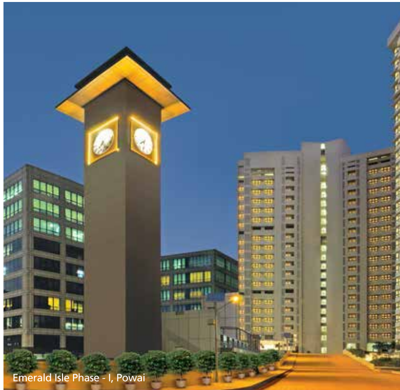
Emerald Isle Phase - I, Powai