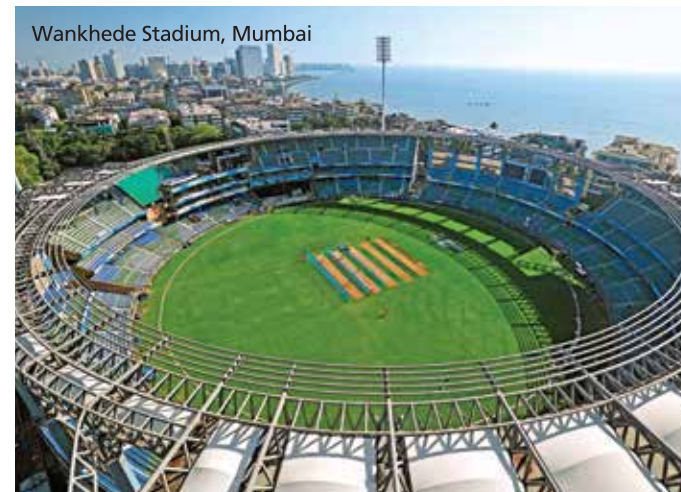
Wankhede Stadium, Mumbai