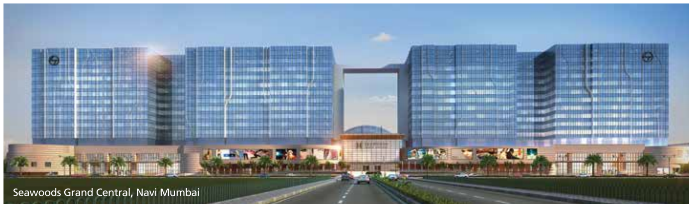
Seawoods Grand Central, Navi Mumbai

A part of mixed-use township, spread across 65 acres, the project is located in the serene locales of Hebbal, Bengaluru. Raintree Boulevard is in close proximity to business parks, lifestyle outlets and leisure activities. Well-designed 3 & 4 BHK apartments, decked with world-class amenities and ample greenery, are the hallmark of the development.