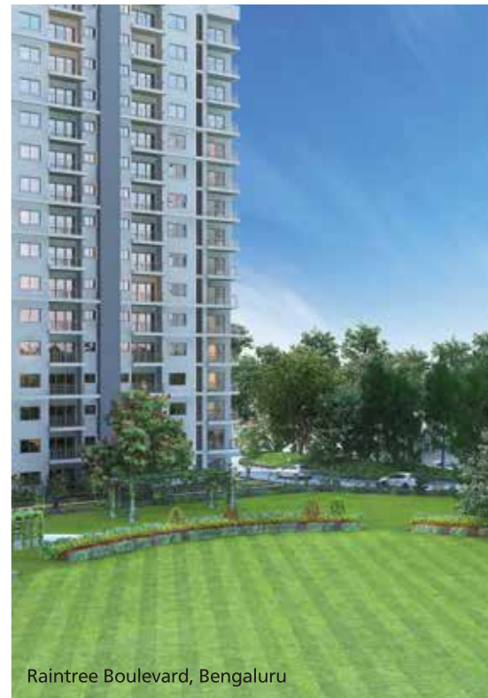
Raintree Boulevard, Bengaluru