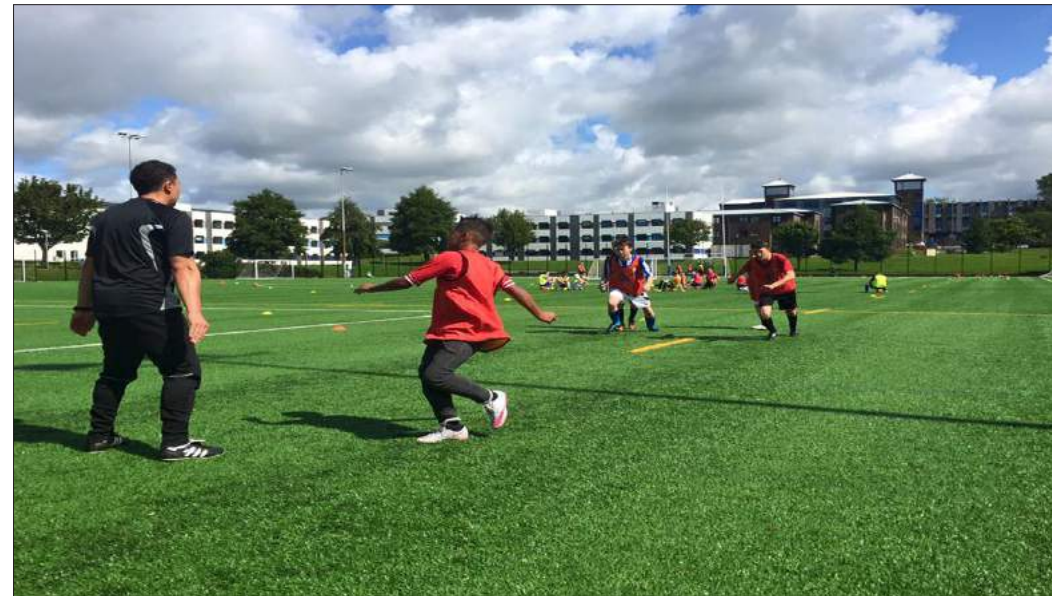
Proposed Play Ground