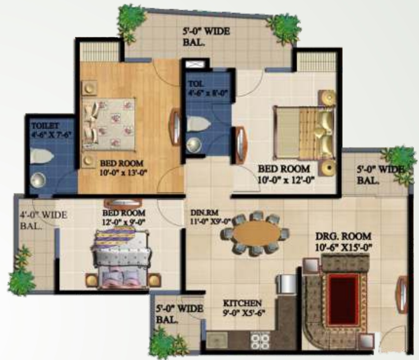
3 Bedroom Flat Super Area - 1295 Sq. Ft. | Flat No. 1, 2, 3,