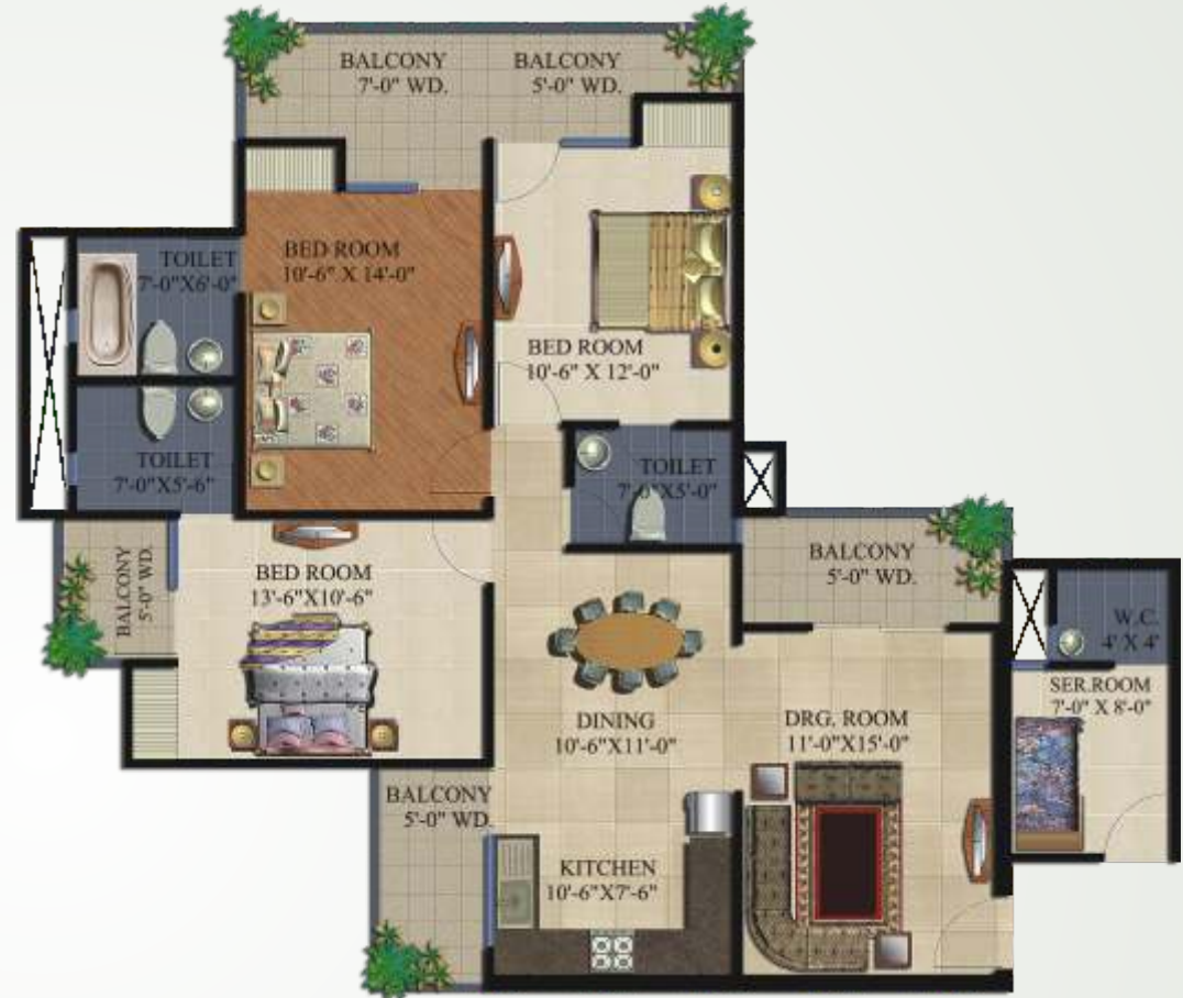
3 Bedrooms with 3 Toilets and Servant Room Super Area - 1750 Sq. Ft. | Flat No. 3, 4