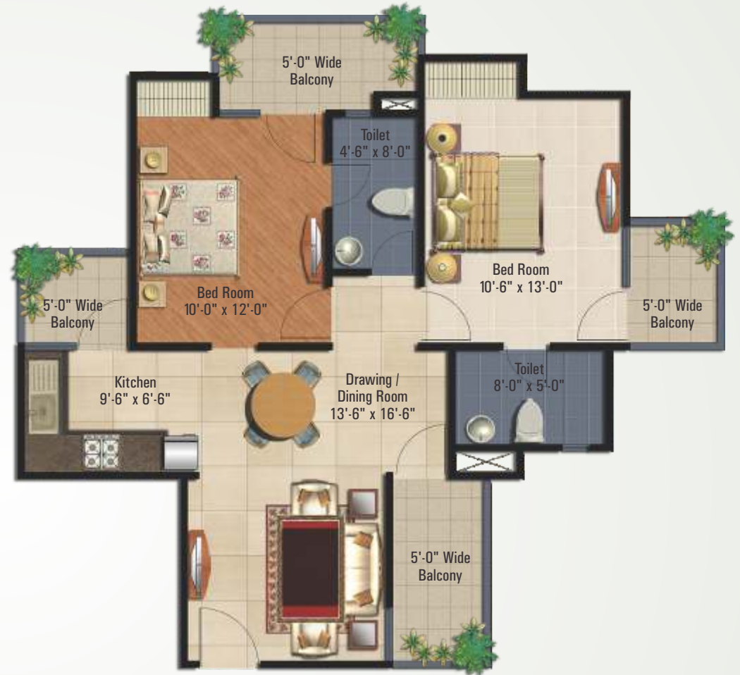
2 Bedroom Flat | Super Area - 1075 Sq. Ft. | Flat No. 5, 6