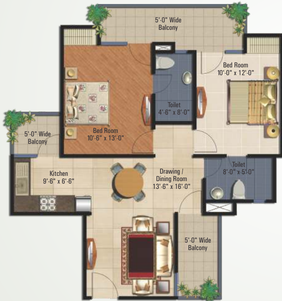
2 Bedroom Flat | Super Area - 1075 Sq. Ft. | Flat No. 4