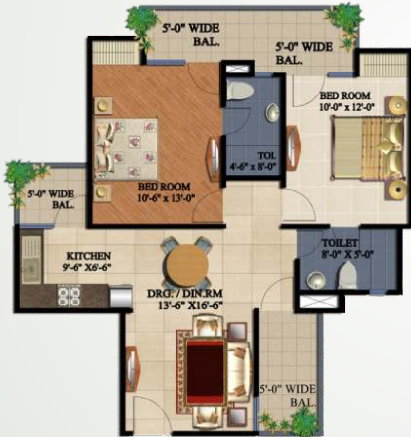
2 Bedroom Flat Super Area - 1075 Sq. Ft. | Flat No. 4