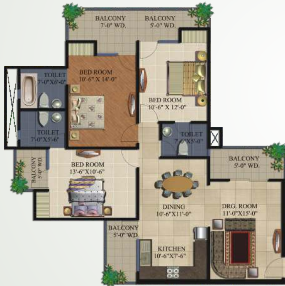
3 Bedrooms with 3 Toilets Super Area - 1595 Sq. Ft. | Flat No. 1, 2