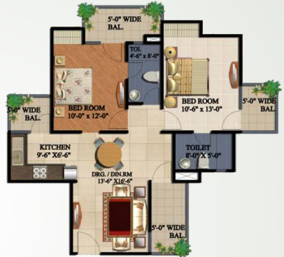
2 Bedroom Flat Super Area - 1075 Sq. Ft. | Flat No. 5, 6