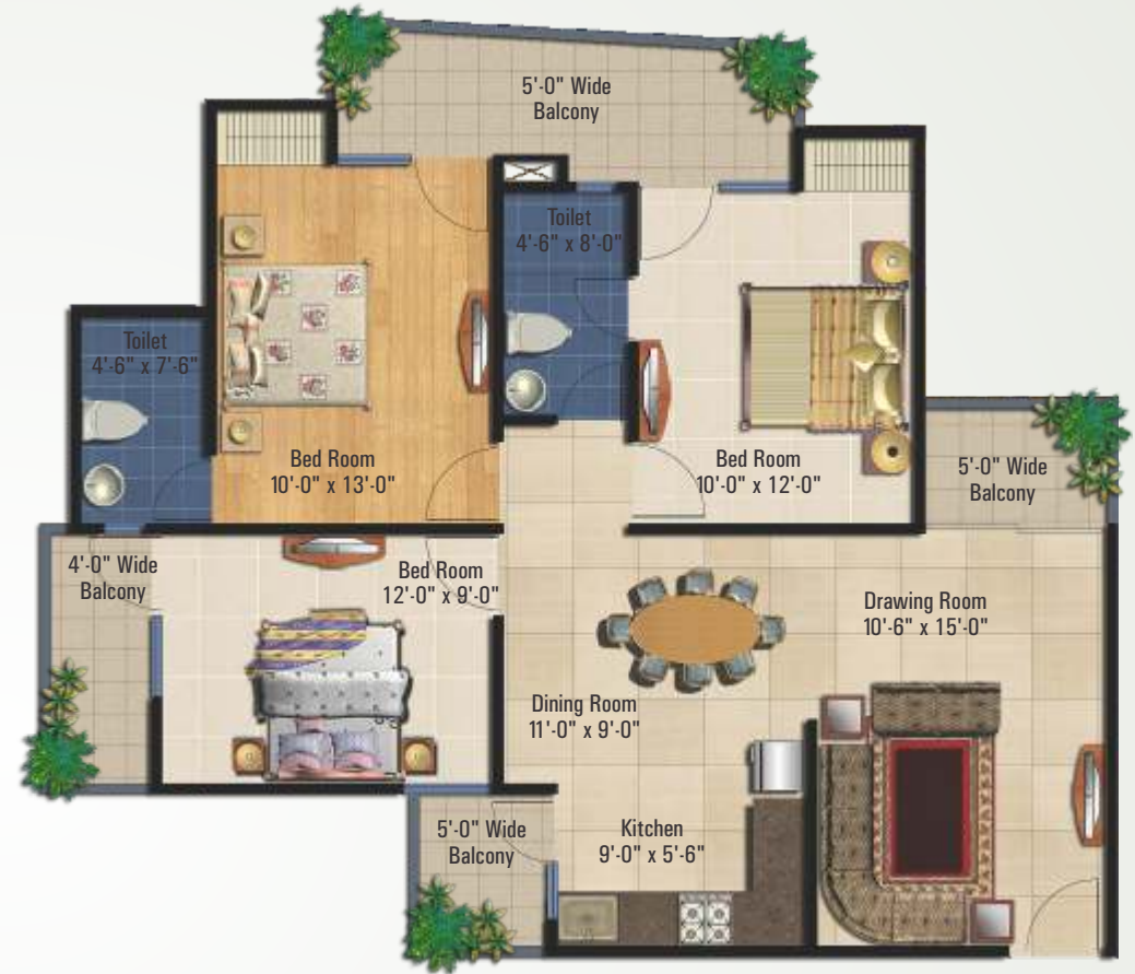
3 Bedroom Flat | Super Area - 1295 Sq. Ft. | Flat No. 1, 2, 3