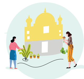
GURUDWARA & WORSHIP HALL