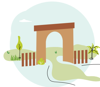
CENTRAL GREEN BOULEVARD

Live amidst the finest amenities in your meticulously designed neighbourhood, be it the integrated green network comprising of a central green boulevard and English-style courts or other world-class amenities like a school and clubhouse. Add to it a police station and a fire station and you know that you are living in a complete ecosystem here.