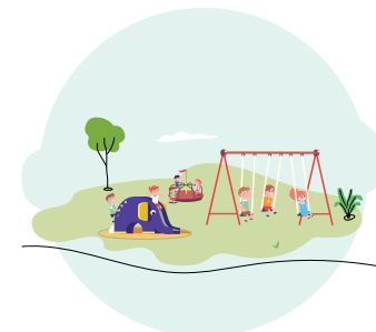
LARGE CHILDREN'S PLAY AREA