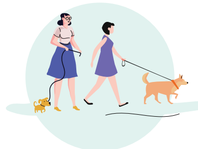
DOG WALK PARK