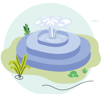
WATER FOUNTAIN & KUND