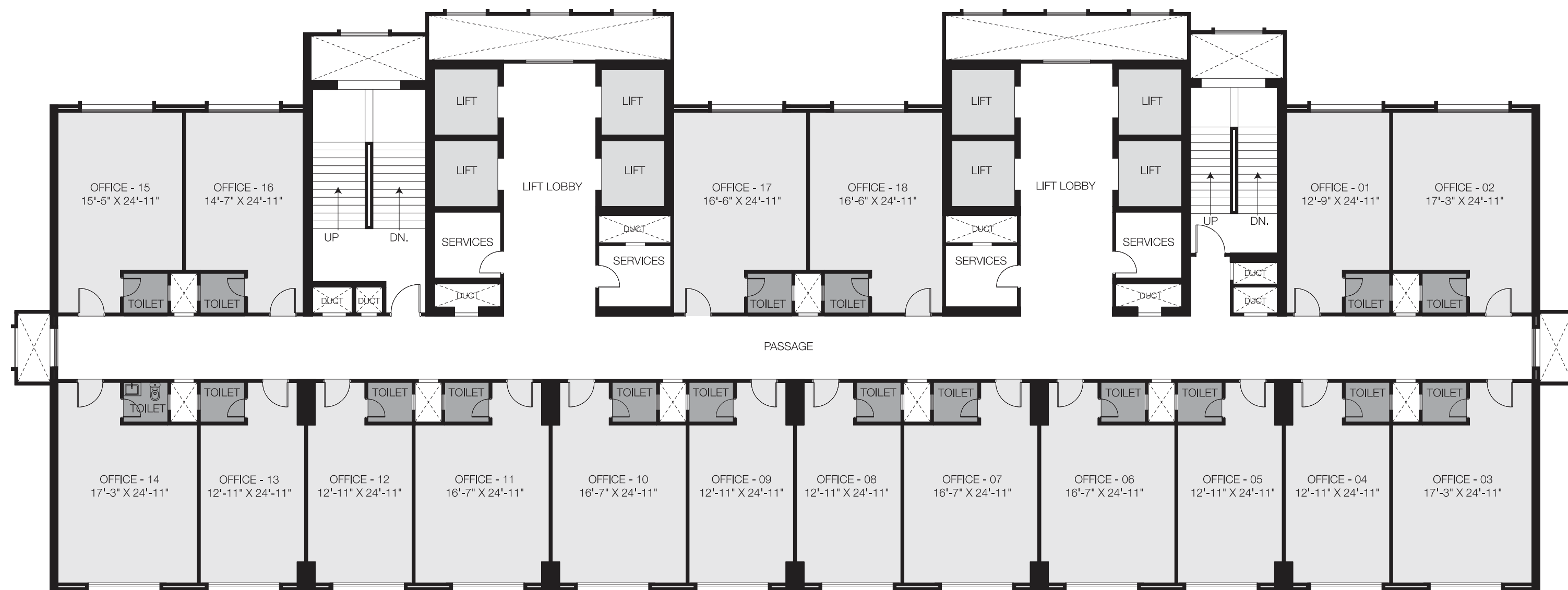
Carpet Area Statement