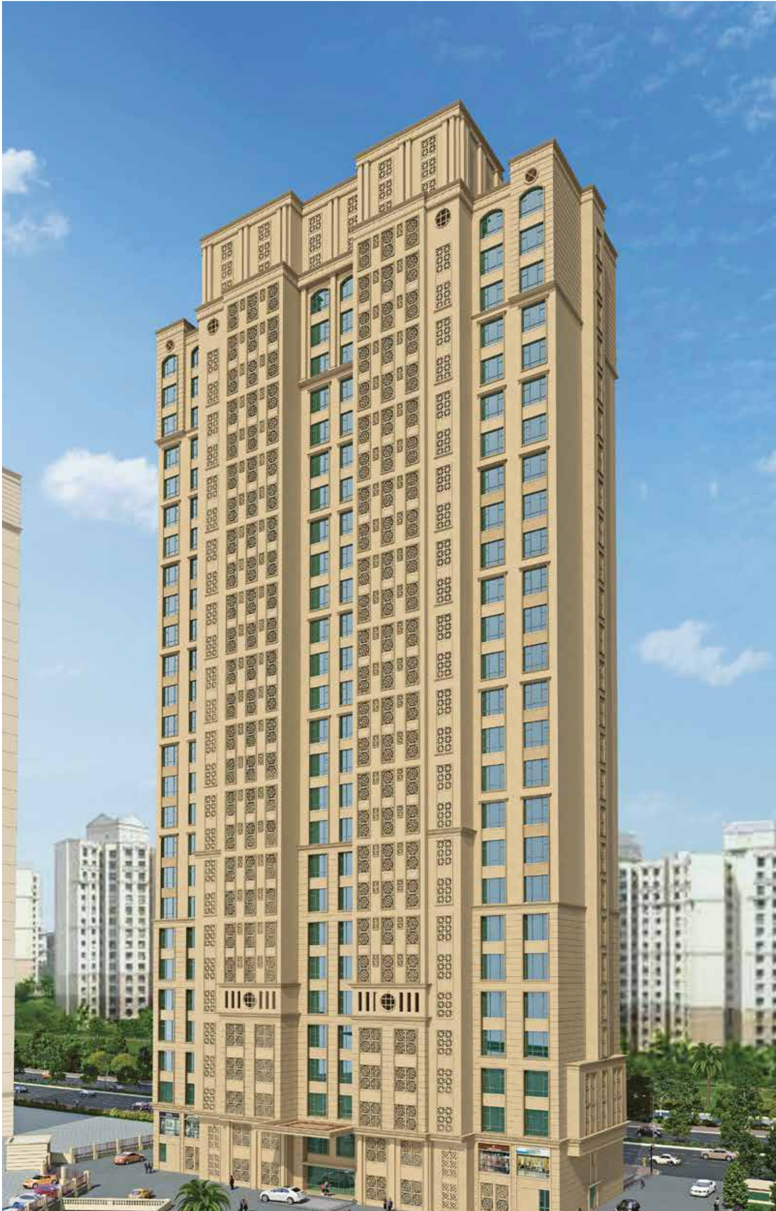
This is a rendered image as visualised by the artist and for reference purpose only.

Ergonomically designed to enhance your every day.