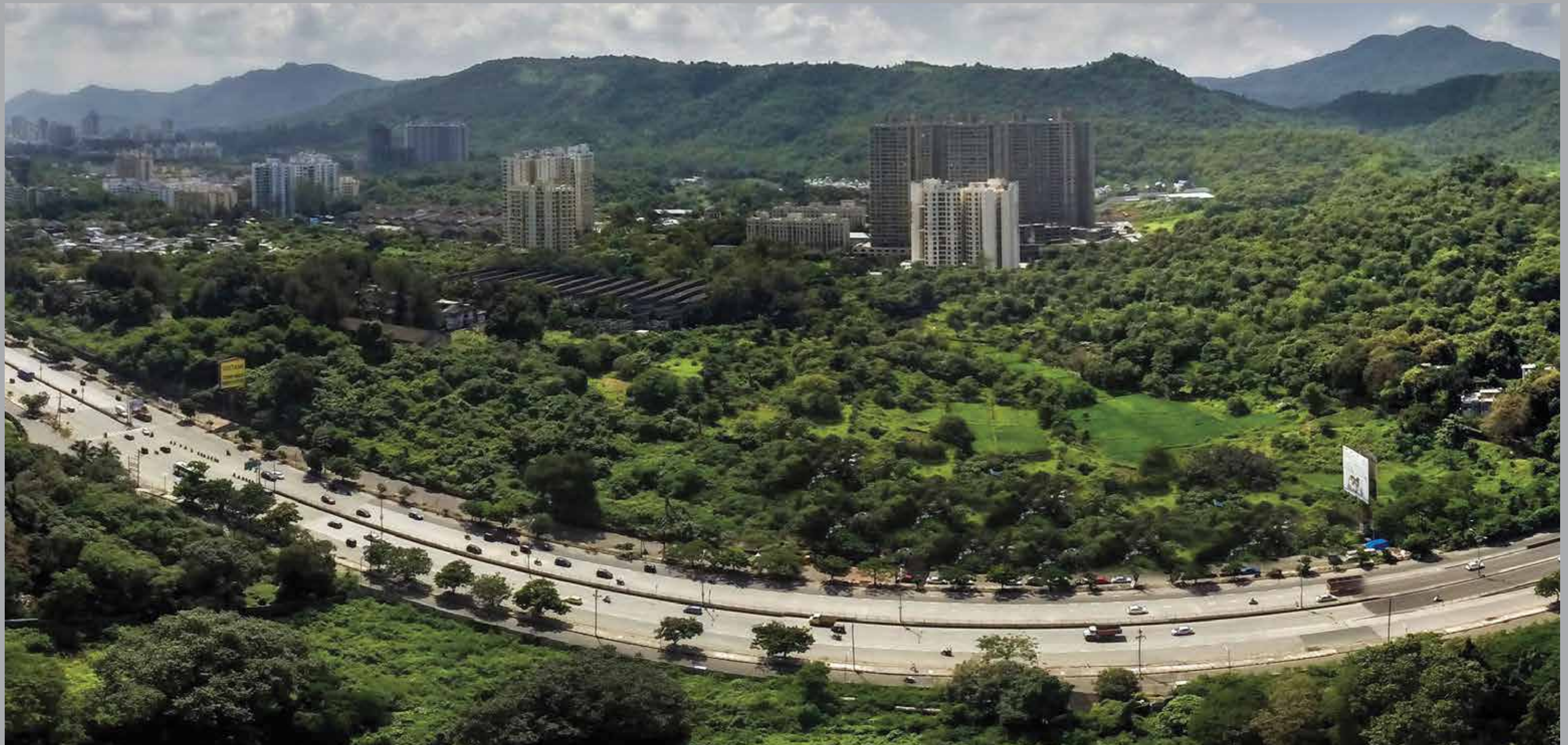
Actual image of Ghodbunder Road, Thane

In today's fast-paced world, it is eminent to make optimum utilisation of time. Therefore, one has to wisely choose the destination for their business. Being settled in Thane, Solus enjoys a plethora of location advantages. It offers supreme level of convenience as all essentials are within the vicinity.