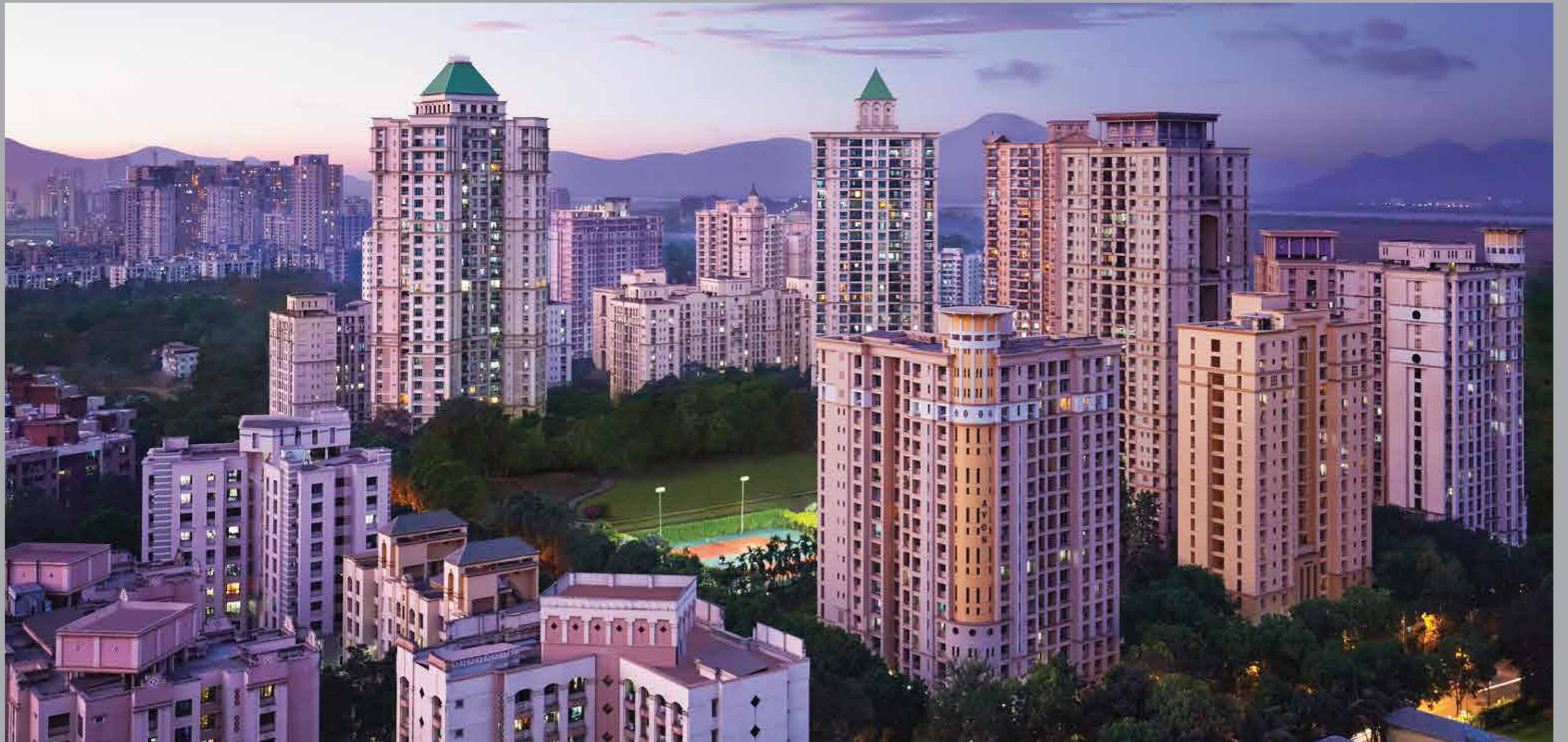
Actual image of Hiranandani Estate, Thane

Hiranandani Estate, Benchmarking community living in Thane.