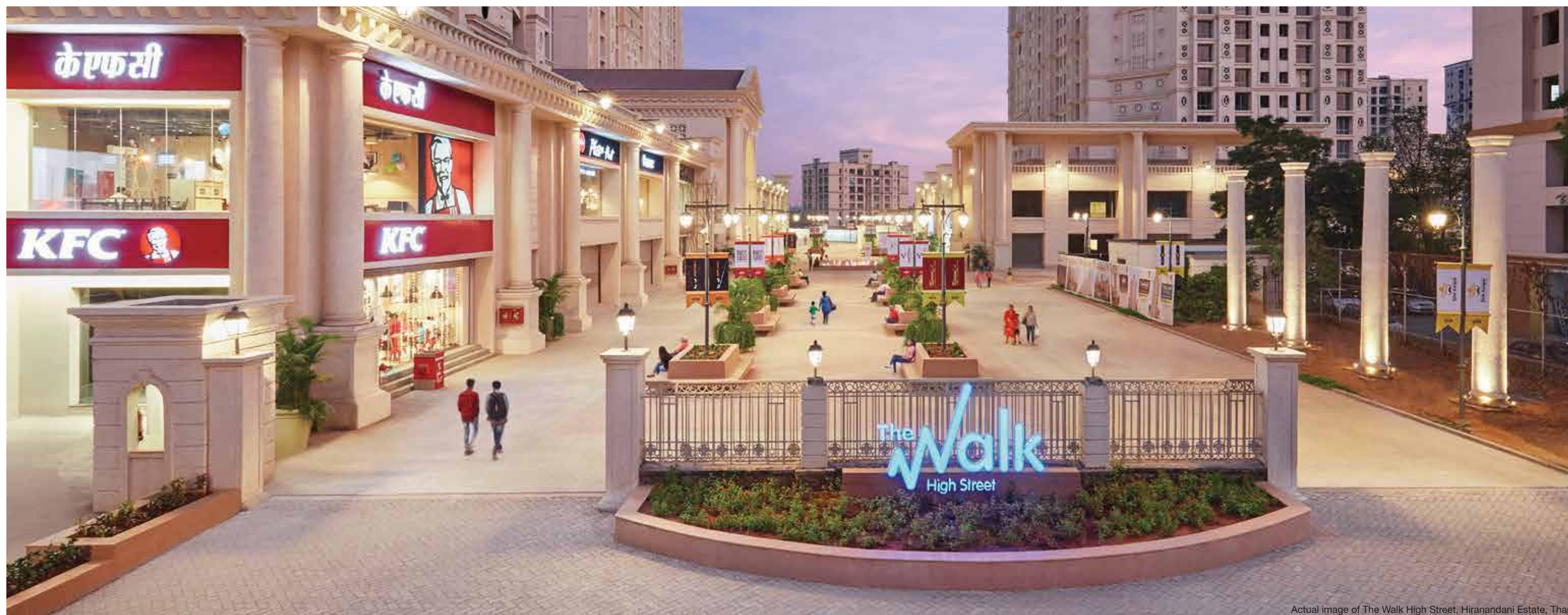
Actual image of The Walk High Street, Hiranandani Estate, Thane