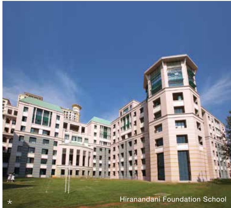
Hiranandani Foundation School