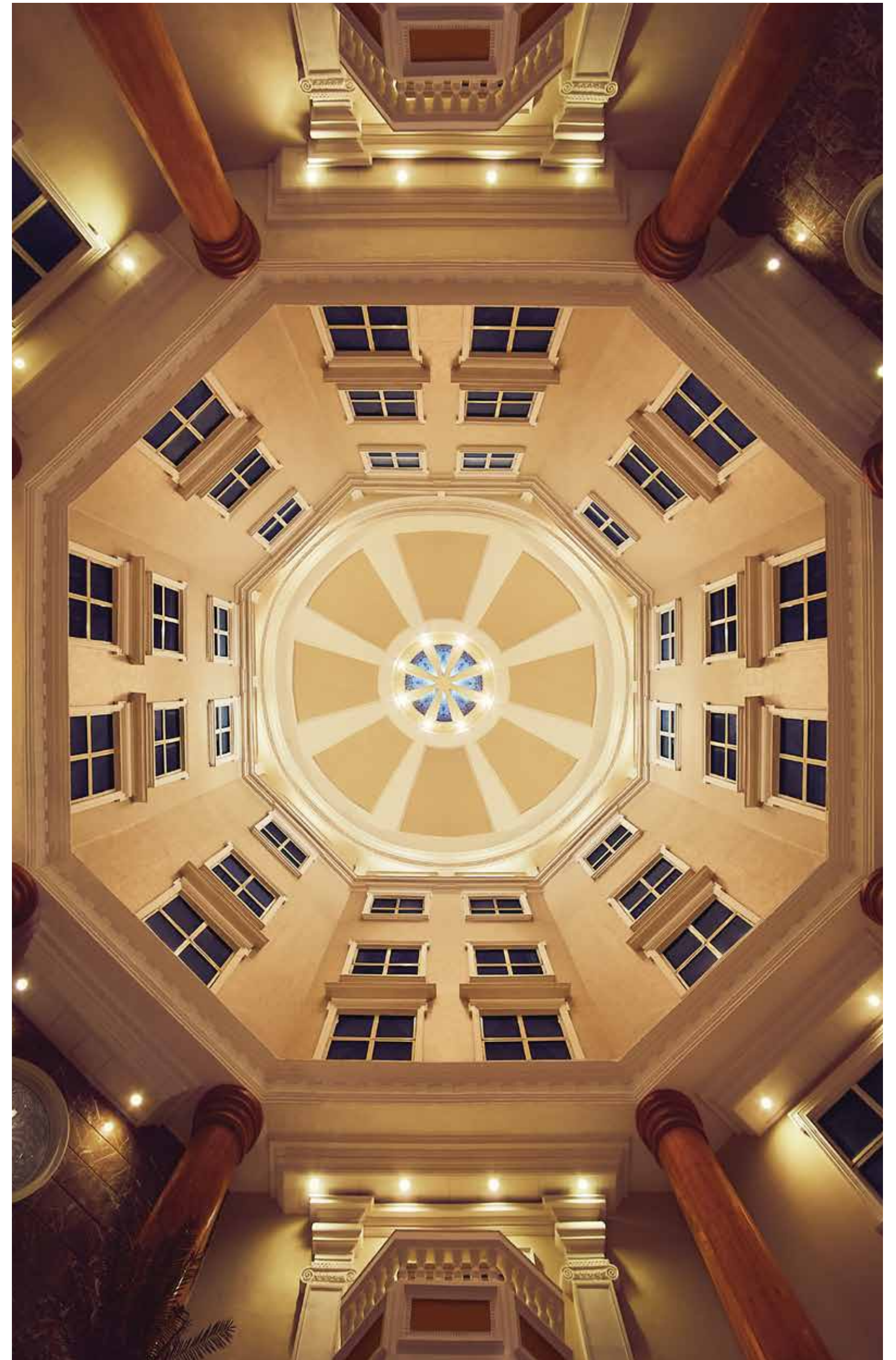
Interior image of Olympia, Hiranandani Gardens, Powai.

Every Hiranandani township reflects this commitment to raising a complete world that looks into all aspects of living. Diverse ventures come together to create an integrated experience, minutely balancing all areas of happiness. An eco-friendly ambience, convenient infrastructure, luxurious lifestyle and proximity to work are seamlessly incorporated together, adding depth and joy to daily life.